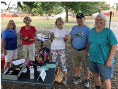
Singing Hills.