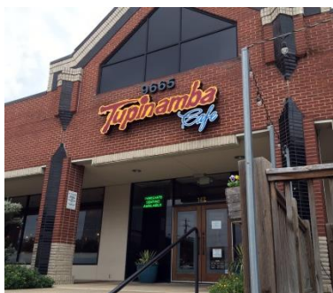
9665 N Central Expy #142, Dallas