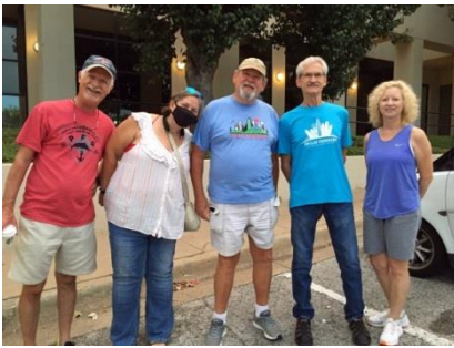
Sunday walkers in August.