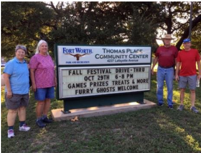
Tarrant County Walkers Arlington Heights walk (photo anonymous).