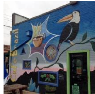
Café Brazil – 2815 Elm St, Dallas