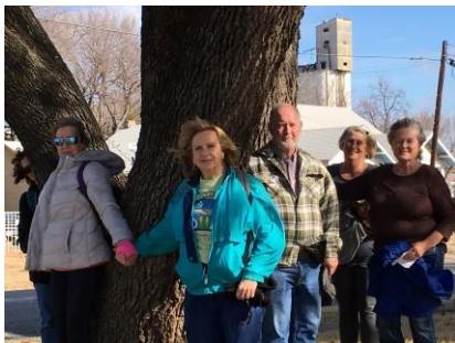
Peeking around in Sherman.