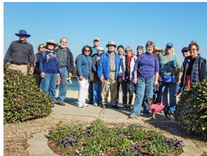
Rockwall YRE, January 6