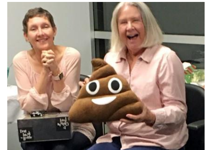
Emoji fun at annual White Elephant social.

Club information: www.dallastrekkers.org • More walk listings: www.ava.org