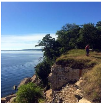
View of Lake Takoma