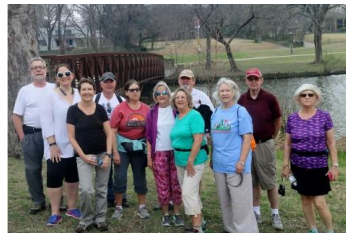
On the trail at White Rock Lake.