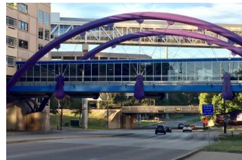
From our Hospital District Walk: (L) Purple arches at Children's Medical Center (R) Water tubes at William Clements University Hospital.