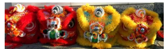
Chinese New Year – Downtown YRE