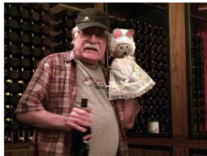
White Elephant Exchange