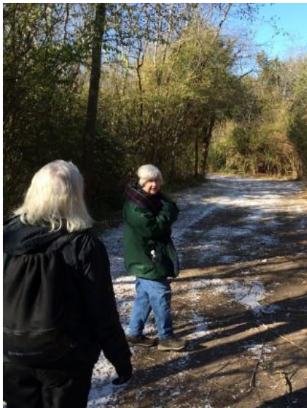
Samuel Farm YRE with snow