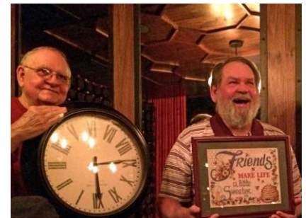
White Elephant Exchange