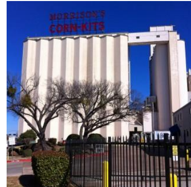
Morrison’s Corn Kits