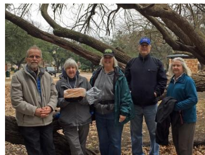
Tietze Park – M Streets YRE