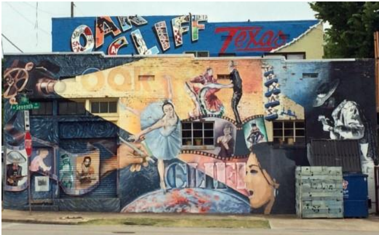
Oak Cliff Mural