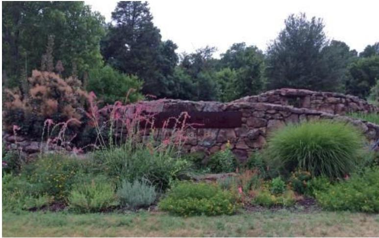
Entrance to 12 Hills Nature Center